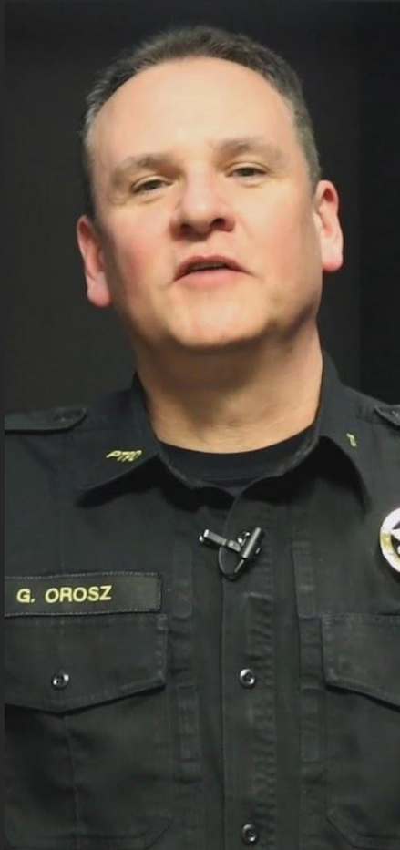
“Citizen’s Police Academy” video