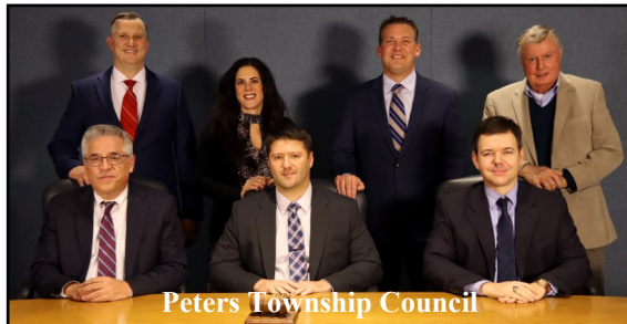
Peters Township Council

The opening and operation of Rolling Hills Park and Fire Station #3, as well as the revisions to the Zoning Ordinances relative to residential development, will remain priorities for Council in 2023.