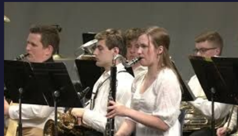
May: PTHS Concerts