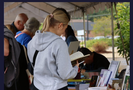
September: Library photos