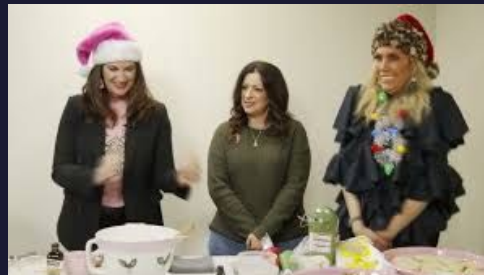
November: New shows