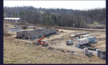
March: Aqua Park photos