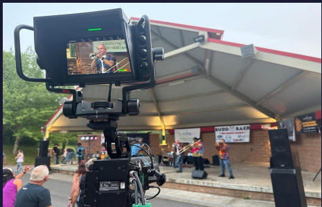
July: Concerts in the Park