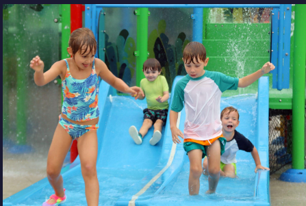
Aqua Park Photos