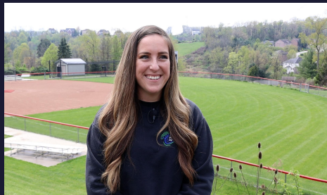
April: Employee Spotlight