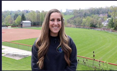
Employee Spotlight Videos