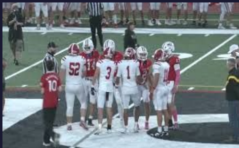
August: Fall sports begin