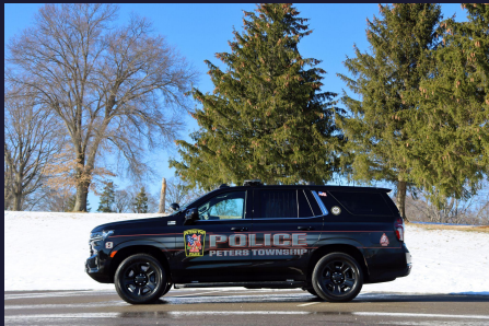
Police Vehicle Photos