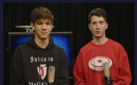
December: PT Full-Court Press