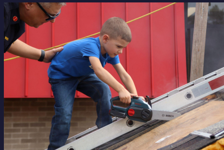
Fire Dept. Open House Photos