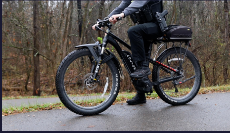
January: e-Bikes video